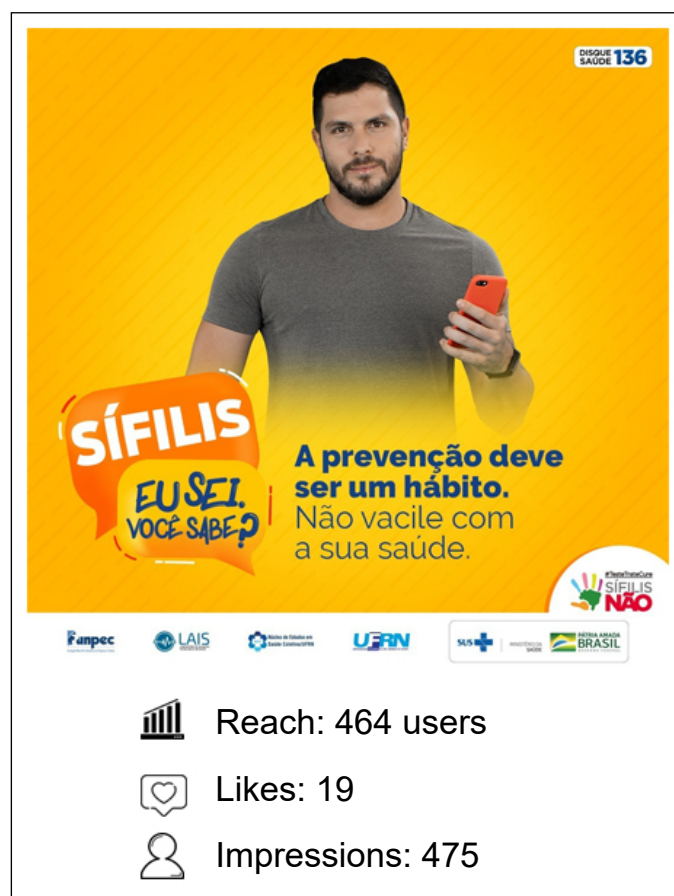
Figure 4 – Post 4: “Prevention” card.