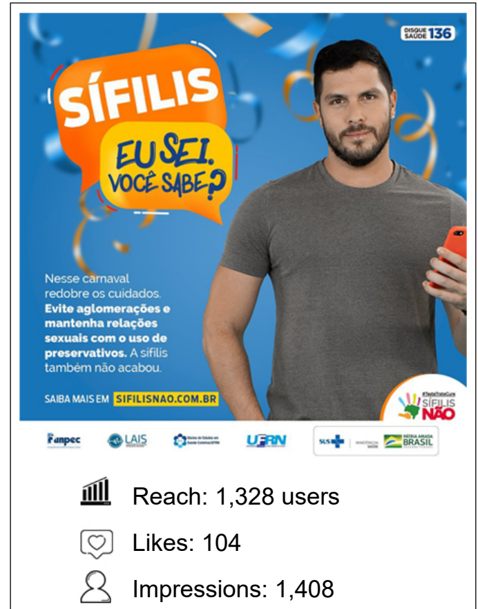
Figure 2 – Post 2: “Carnival” card.

importance of testing to prevent the spread of syphilis. Piece 4, on the other hand, outlined a content approach aimed at discussing the theme of syphilis reinfection, making a connection with the need for periodic testing with a view of prevention.