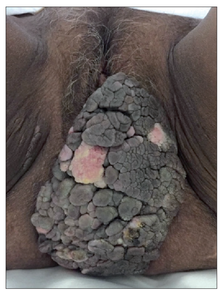
Figure 4 – Giant Condyloma of the left lower third of the labia majora until perineal region (Patient "C").